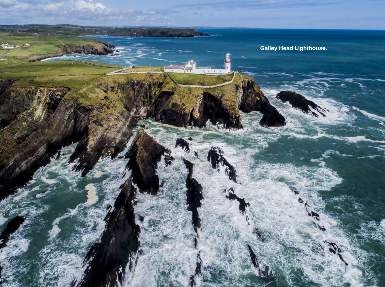
Galley Head Lighthouse.