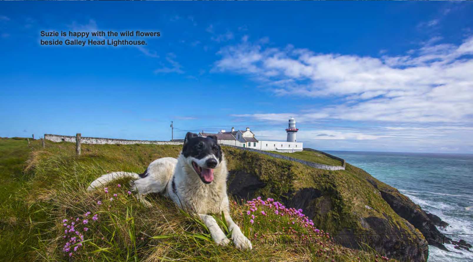
Suzie is happy with the wild flowers beside Galley Head Lighthouse.