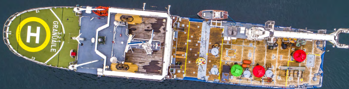
And last but not least here is an overhead view of the ILV Granuaile , the Commissioners of Irish Lights tender, anchored in Berehaven Sound on the Beara peninsula. I didn't manage to catch any of the crew sunbathing!! The white fork-like object is the crane for lifting buoys etc. out of the sea, some of which you can see on the aft deck.